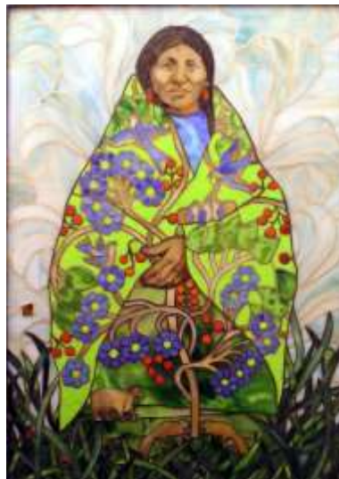
the Great Mother