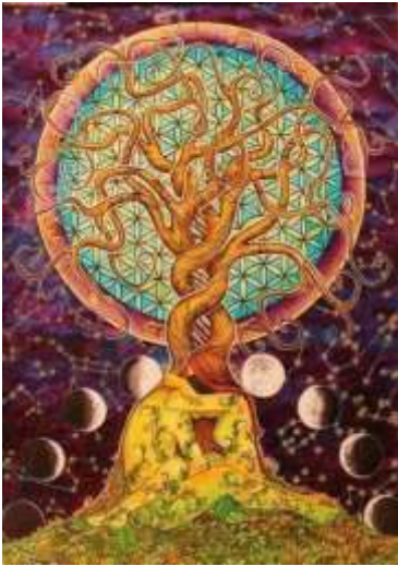
the Tree of Life